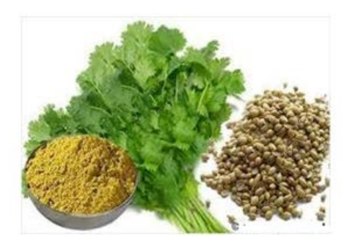
Figure 1.2: coriander (powder, leaves, fruits)

seeds turn yellow .It requires optimum temperature of 20 to 26°c for growth. 70% of global requirement of coriander is produced in india. are sub globular, crowned by the remains of sepals and styles, primary ridges 10, wavy and slightly inconspicuous secondary ridges 8, straight, and more prominent.