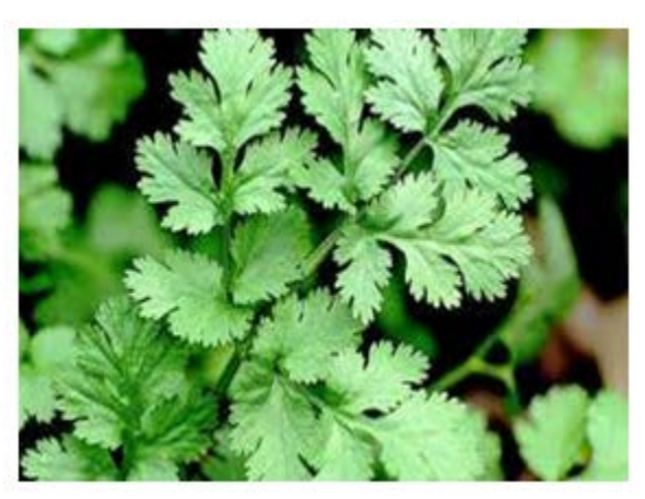
Table No 1.1: Coriander Description